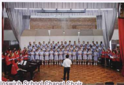
Ipswich School Chapel Choir與女聲合唱團同台大演出

10月底，Ipswich School Chapel Choir蒞臨與本校女聲合唱團交流，帶來了多首英國的經典作品，更與本校同學合唱John Rutter的名曲《The Lord Bless You and Keep You》。Ipswich School的同學也參觀了本校的文物徑，了解二戰期間英軍在香港的事跡。