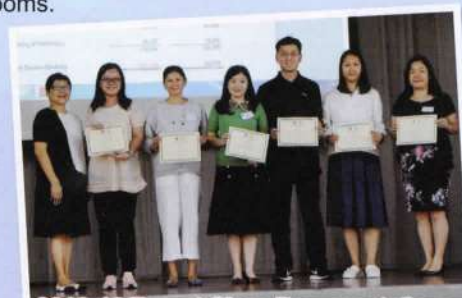
2018-19 Parent Class Representatives