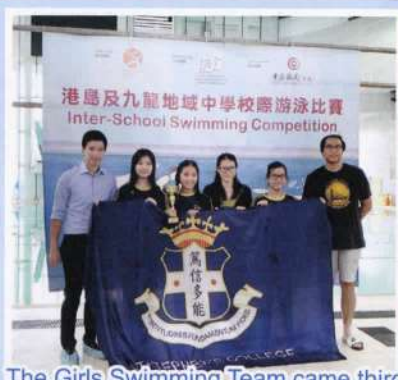
The Girls Swimming Team came third