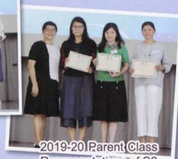
2019-20 Parent Class Representatives of S3