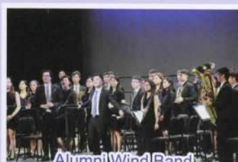
Alumni Wind Band