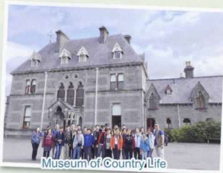
Museum of Country Life

The highlights of the trip included a visit to Trinity College to see the Book of Kells, Ceide Fields, Museum of Country Life, Grave of W.B. Yeats, Cliffs of Moher and Trad on the Prom Irish Dance Show.