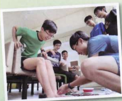
Serving others by washing their feet

To build up students' leadership skills is one of the school's focuses. In order to provide more opportunities for our S3 boarders to do so, the College collaborated with U-Fire Network to run a Servant Leadership Programme.