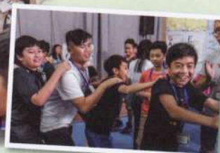
Learning through games