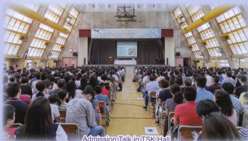
Admission Talk in TSK Hall