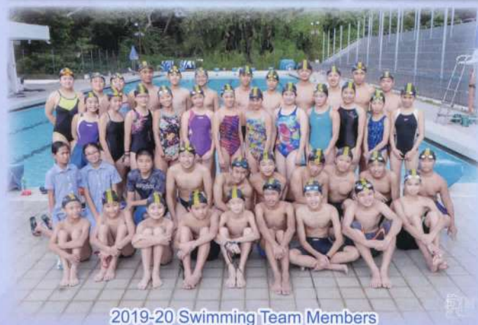
2019-20 Swimming Team Members