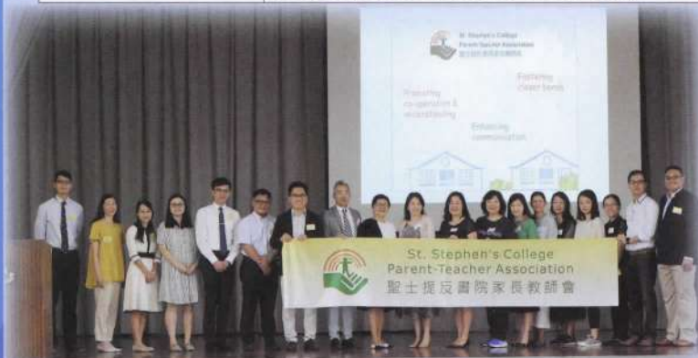
PTA Executive Committee Members