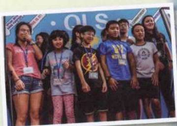
Presentation skills training

Before the new school term, incoming S1 students took part in the Quantum Learning Camp in August 2019. Focussing on the eight keys of excellence, i.e. Integrity, Failure Leads to Success, Speak with Good Purpose, This is It, Commitment, Ownership, Flexibility and Balance, the camp aimed to strengthen their social, communication and adaptive skills and build a robust foundation for them to get the most out of their secondary school life. Students also improved their study skills, such as memorization, note-taking, reading, writing and listening, in a stimulating environment that boosted their confidence and motivation. On the whole, this programme was very well received by students and parents alike.