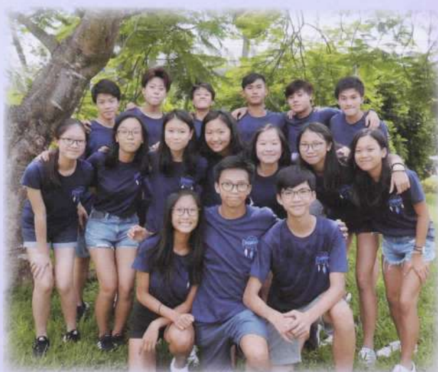
We are Dreamers!

We welcome all opinions and suggestions from the school and the students. Let's work together and build a better SSC!