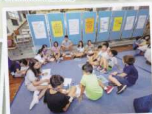
Students engaged in their group discussion