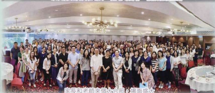
家長和老師來個大合照，場面盛大