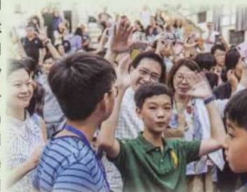
Happy faces at the graduation ceremony