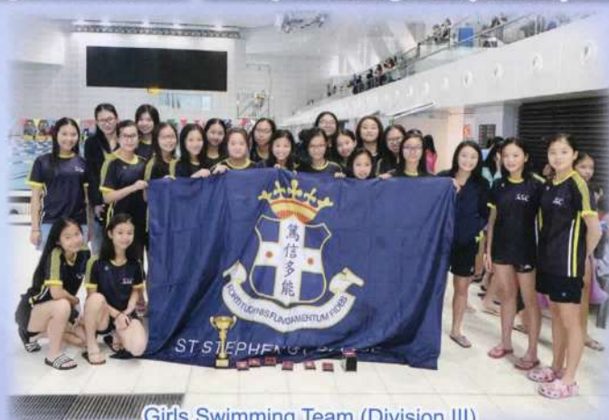
Girls Swimming Team (Division III)