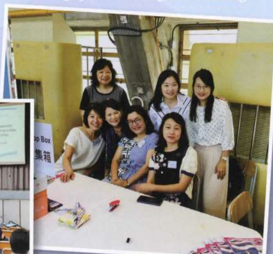
PTA Parent Volunteers