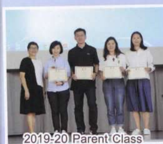
2019-20 Parent Class Representatives of S2