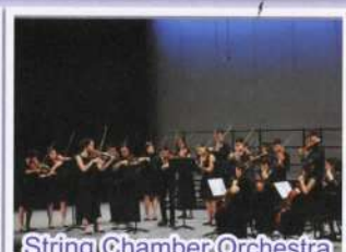
String Chamber Orchestra