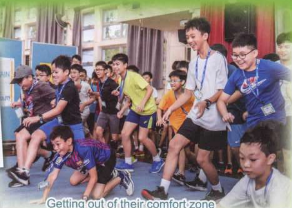
Getting out of their comfort zone