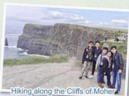
Hiking along the Cliffs of Moher