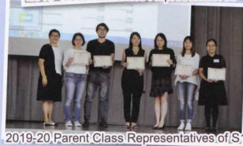
2019-20 Parent Class Representatives of S1