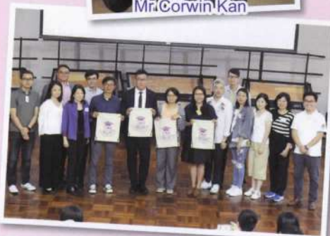
Presentation of souvenirs to the speakers