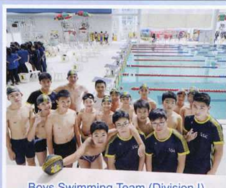
Boys Swimming Team (Division I)