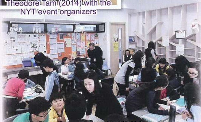
Lesson observation at SSCPS with Chinese Department