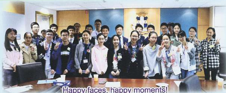
Happy faces, happy moments!

One of our sister schools from Zhejiang, Zhenhai Middle School, paid a visit to St Stephen's College on 24 April 2017. Both schools took this opportunity to showcase the characteristics of their respective school curricula. Our emphasis on STEM was the highlight. The students involved presented their ideas about their STEM projects and how they put them into practice. The school representatives and students from Zhenhai Middle school also had classroom observations and exchanged their ideas in a group discussion with students and teachers. The Heritage Trail, a tour guided by our docents, was very well received. All in all, it was a truly valuable exchange experience for both schools.