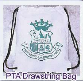
PTA Drawstring Bag