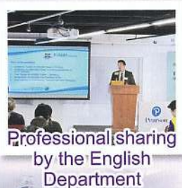
Professional sharing by the English Department