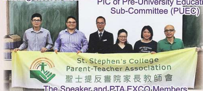
The Speaker and PTA EXCO Members