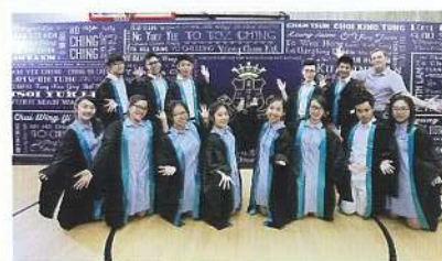
The memorable times of 6Y