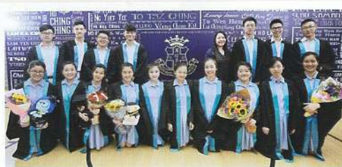
The happy experiences of 6L