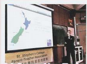
Briefing on New Zealand

We will continue to invite country-specific experts of overseas studies with job market perspectives to share with our parents and students in the future.