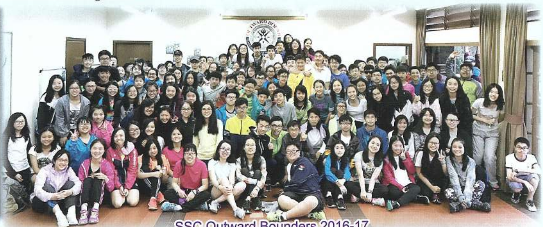
SSC Outward Bounders 2016-17