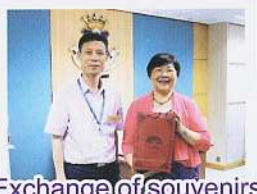
Exchange of souvenirs from both schools