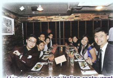
Happy faces at an Italian restaurant