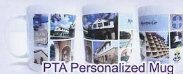
PTA Personalized Mug

As in last year, all S6 graduates received a personalized named mug from the Parent-Teacher Association as their graduation gift. We hope that this mug, which is printed with photos of SSC campus, will bring back many fond memories of their secondary school life. Besides the mug, a drawstring bag printed with a crest depicting different corners of SSC was also given to each graduate as a keepsake.