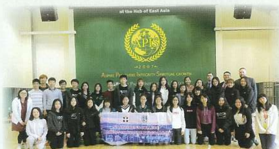
Asia Pacific International School