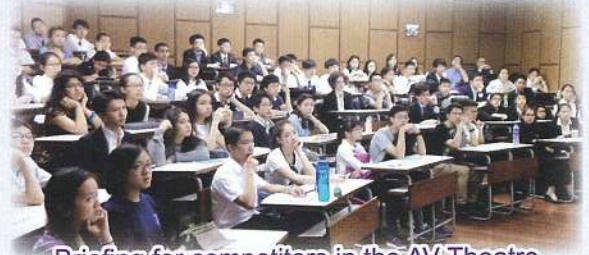
Briefing for competitors in the AV Theatre

In collaboration with Oxford Union and University of Oxford, the College played host to the Hong Kong Round of their annual debating competition from 21 st to 23 rd December 2016. Dozens of international and local schools were on campus for multiple rounds of competitive debating in the British Parliamentary format. Representatives from the Union also held workshops and demo-debates for our budding debaters in the St. Stephen's programme.