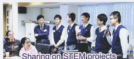
Sharing on STEM projects by our students