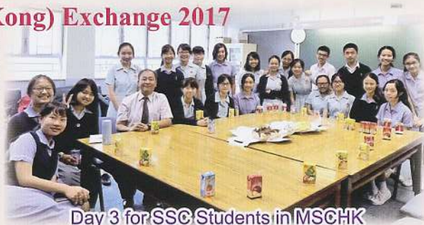
Day 3 for SSC Students in MSCHK

St. Stephen's College and Munsang College (Hong Kong) organized an exchange programme for our students on 8,9,11 May 2017. Ten SSC students and eight MSCHK students participated in this memorable exchange programme.