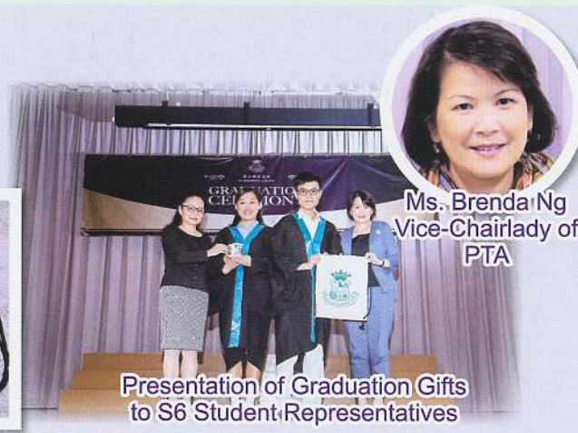
Presentation of Graduation Gifts to S6 Student Representatives