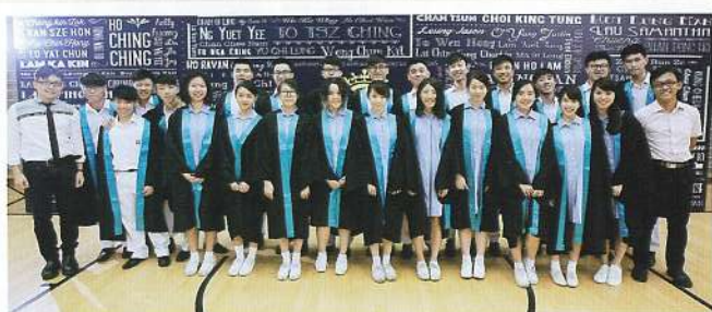
Say goodbye to SSC (6C)