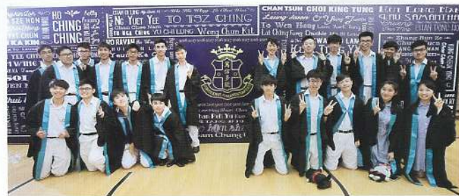
The precious moments 6J will lock in their minds