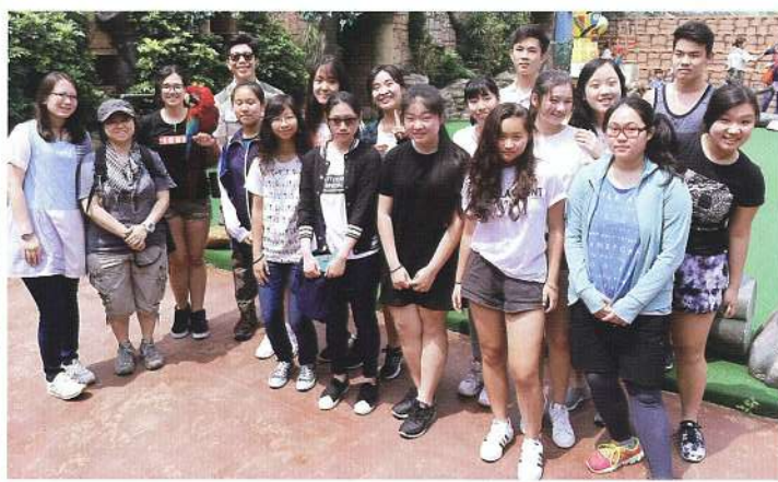
Exploring bird husbandry