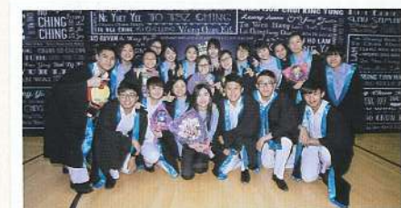
Smiles from ear to ear (6D)