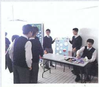
Do you know what the fruit of the Spirit is?